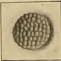
Fig. 4. Dryopteris Lloydii , sori, \times 18 .

sori are from 4 to 6 in number and do not so nearly cover the whole area of the pinnule as in Dryopteris Lloydii . The pits left